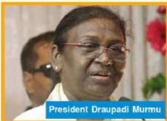
President Draupadi Murmu