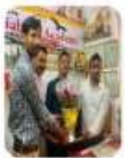
Nitya Pyat Punjab National Bank (P.N.B.)