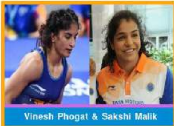
Vinesh Phogat & Sakshi Malik